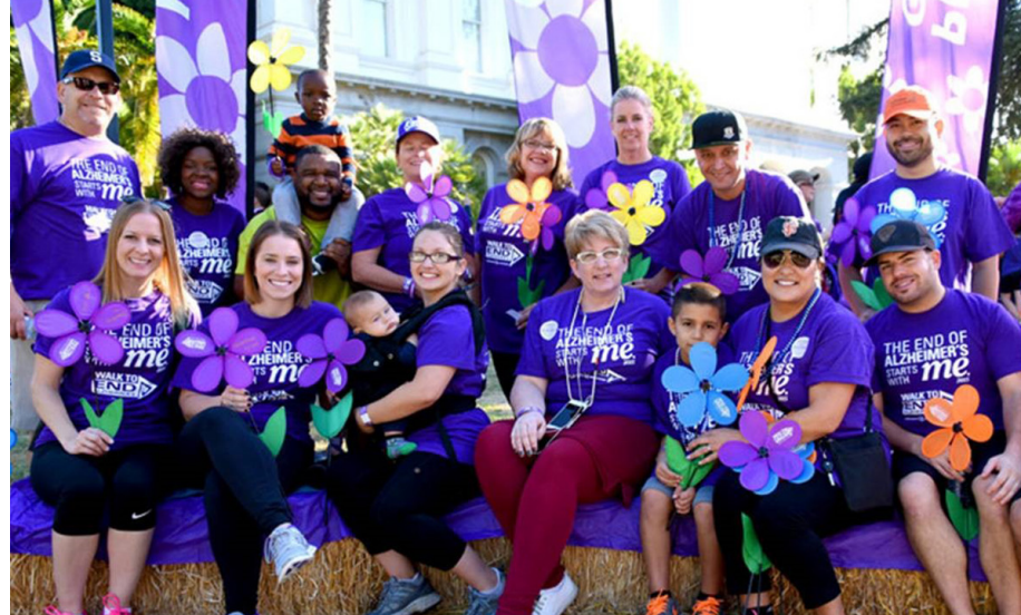
Lionakis team members and their families during an Alzheimer's Association event

From its inception, the Lionakis Foundation has been employee-led, ensuring active staff involvement in the company's philanthropic values. We offer flexible giving options to encourage participation. For example, during orientation, new employees are invited to contribute $5 each pay period to the Lionakis Foundation; while it's completely voluntary, about 25% participate. Many employees give annually through one-time donations or unused paid time off,