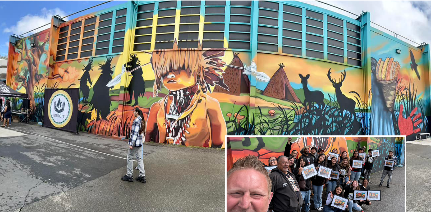
Over five days, local youth painted the mural with the guidance and support of experienced muralists from Hope Through Art.